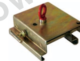
篷房吊夹 Marquee Clamp