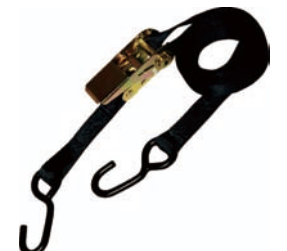
飞机带/捆绑带 一体式 Ratchet Strap