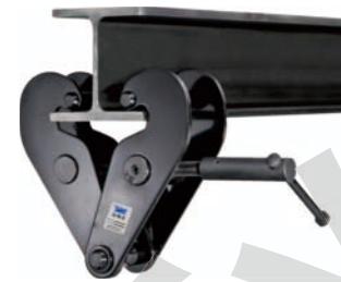
束夹 Beam Clamp