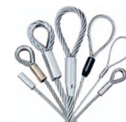
保险钢丝 Steel Wire