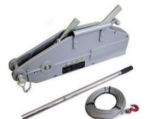
钢丝绳拉葫芦可提供1600KG的WLL Available with a WLL of 1600KG