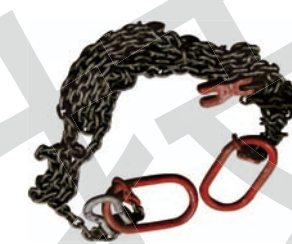
铁链与吊环 Chain with Ring